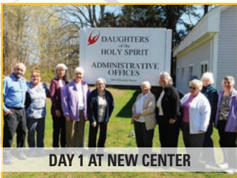
DAY 1 AT NEW CENTER