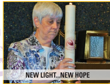
NEW LIGHT...NEW HOPE