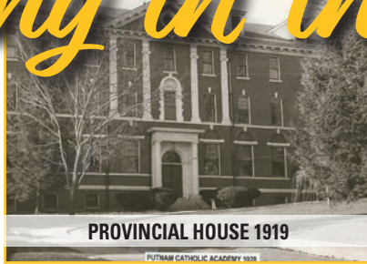
PROVINCIAL HOUSE 1919 PUTNAM CATHOLIC ACADEMY 1919