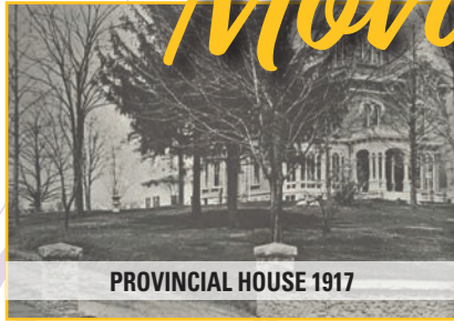
PROVINCIAL HOUSE 1917