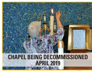
CHAPEL BEING DECOMMISSIONED APRIL 2019