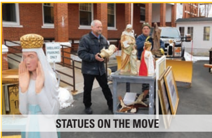
STATUES ON THE MOVE