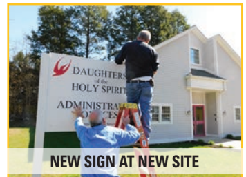
NEW SIGN AT NEW SITE