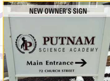
NEW OWNER'S SIGN