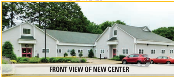
FRONT VIEW OF NEW CENTER