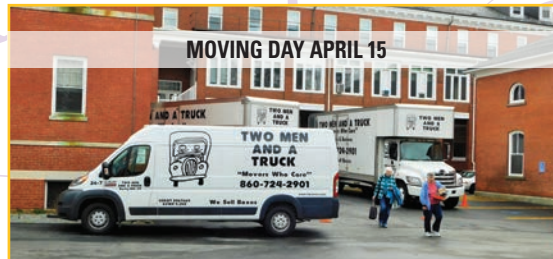
MOVING DAY APRIL 15