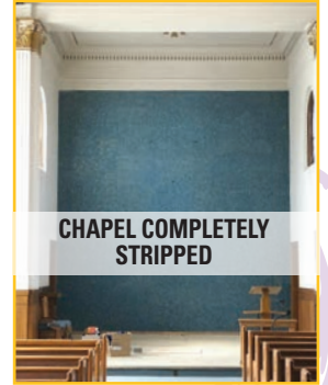
CHAPEL COMPLETELY STRIPPED