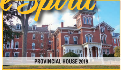
PROVINCIAL HOUSE 2019